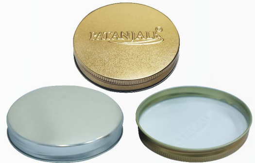
82mm Screw Cap