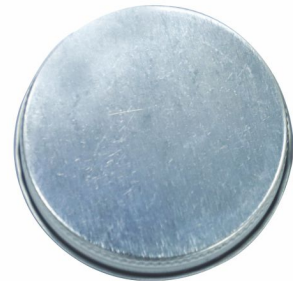
48mm Screw Cap