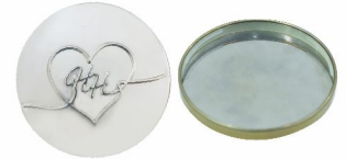
106mm Stainless Steel Candle Jar Lid with Liner Plain, Embossed & Gold Finish