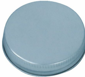
45mm Screw Cap