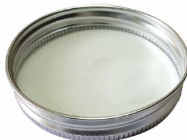
58mm Screw Cap