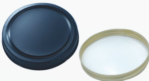
95mm & 100mm Screw Cap