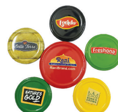
BPA NI Lug Caps Pthylate Free Lug Caps