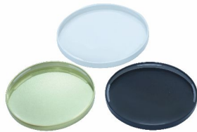
126mm Candle Jar Lid with Liner