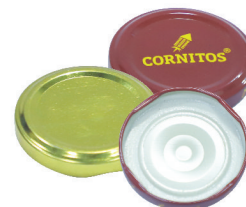
58mm Lug Cap