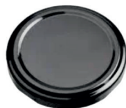
48mm Lug Cap