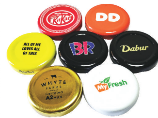
43mm Lug Cap