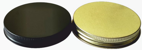
70mm Small Height Screw Cap