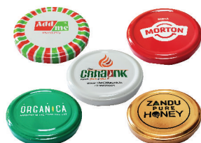
82mm Lug Cap