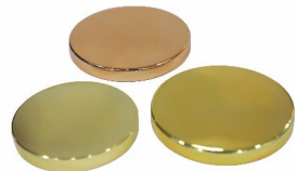
UV Candle Jar Lid with Liners