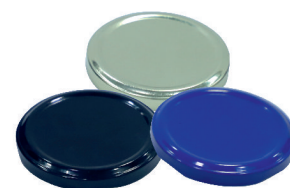
70mm Lug Cap