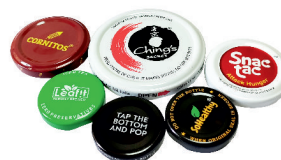
Popup Lug Cap in All Sizes