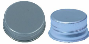
31mm Screw Cap