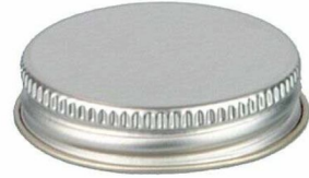
43mm Screw Cap