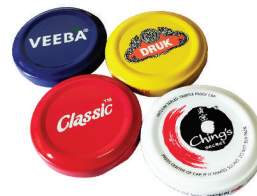
53mm Lug Cap