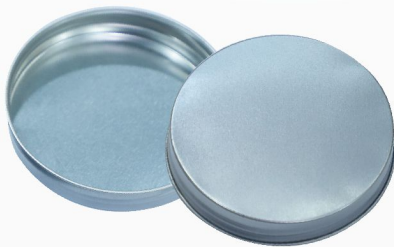
85mm Screw Cap