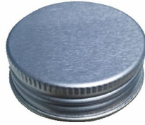
42mm Screw Cap