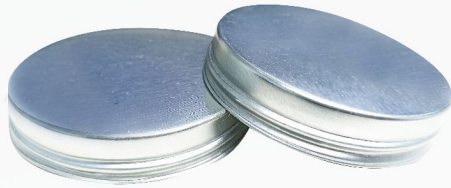
66mm Screw Cap