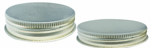
• 63mm Screw Cap • 63mm Long Height Screw Cap