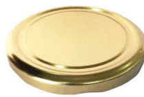
38mm Lug Cap