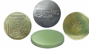
106mm Candle Jar Lid with Liner Plain & Embossed