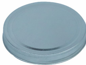
53mm Screw Cap