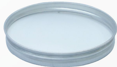
89mm Screw Cap