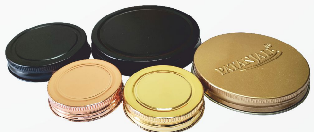
UV Finish, Matt Finish & Emboss Screw Caps