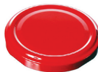
66mm Lug Cap