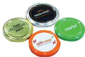
63mm Lug Cap