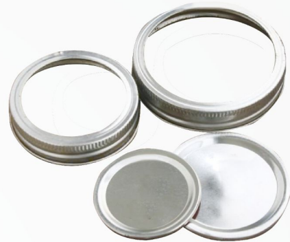
70mm & 86mm Mason Jar Canning Lid with Screw Cap