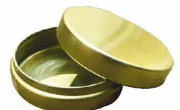
Small Pocket Size Tin Cans