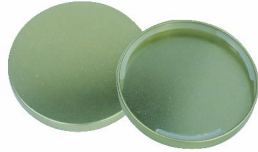
91mm Candle Jar Lid with Liner