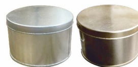
80mm X 50mm Tin Cans