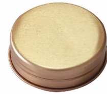
38mm Screw Cap