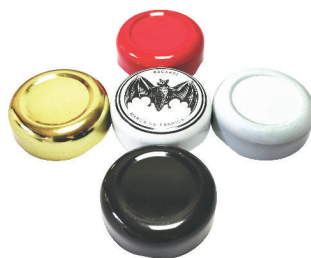
30mm Lug Cap