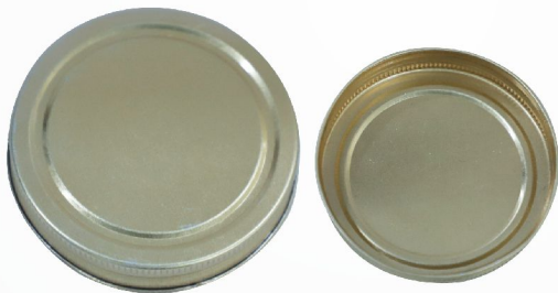
73mm Screw Cap