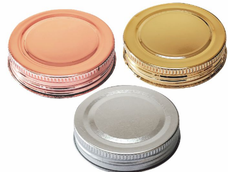
55mm Screw Cap